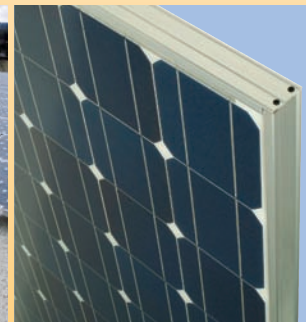
Improved Frame Technology